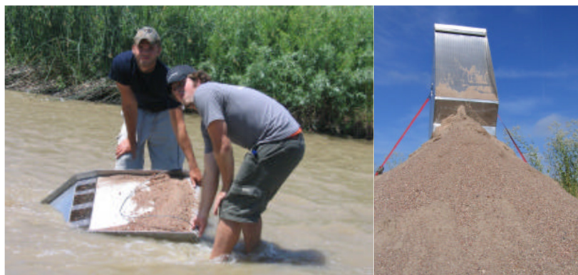
Figure 7 2-ft collector (right) and drop box (left) used to estimate production rates.

Production rate was the key performance parameter measured. Prior to installation of the 30-ft bedload collector, a 2-ft bedload collector (shown in Figure 7 right) was temporarily installed in Fountain Creek to estimate bedload transport extraction rates and assess optimal elevation for collector operation. The 2-ft collector pumped sediment into a drop box (Figure 7 left) that, in turn, allowed a 3 cu ft container to be filled with the subsequent fill time noted to calculate a production rate. Sediment was collected over a three day duration with extraction rates at respective stream flows listed in Table 2. Assuming a linear extraction rate function for a longer collector, respective production rates were estimated for a 30-ft long collector and listed in Table 2 as well.