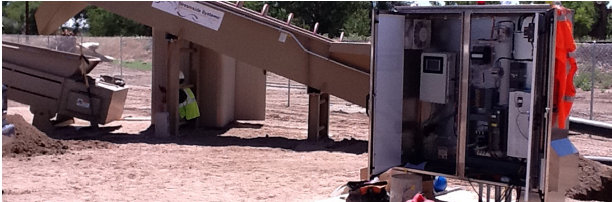
Figure 5 Electronic control panel and Archimedes screw separator.

Electronic controls (Figure 5) enable automatic or remote operation, reducing or eliminating the cost of labor to supervise operation. The system can be set to run at specified times, as a function of stream gage data, or as a function of hopper capacity (still in development). Dredge pumps, piping, separators, and stackers are all off the shelf technology used in dredging and other industries with documented performance metrics.