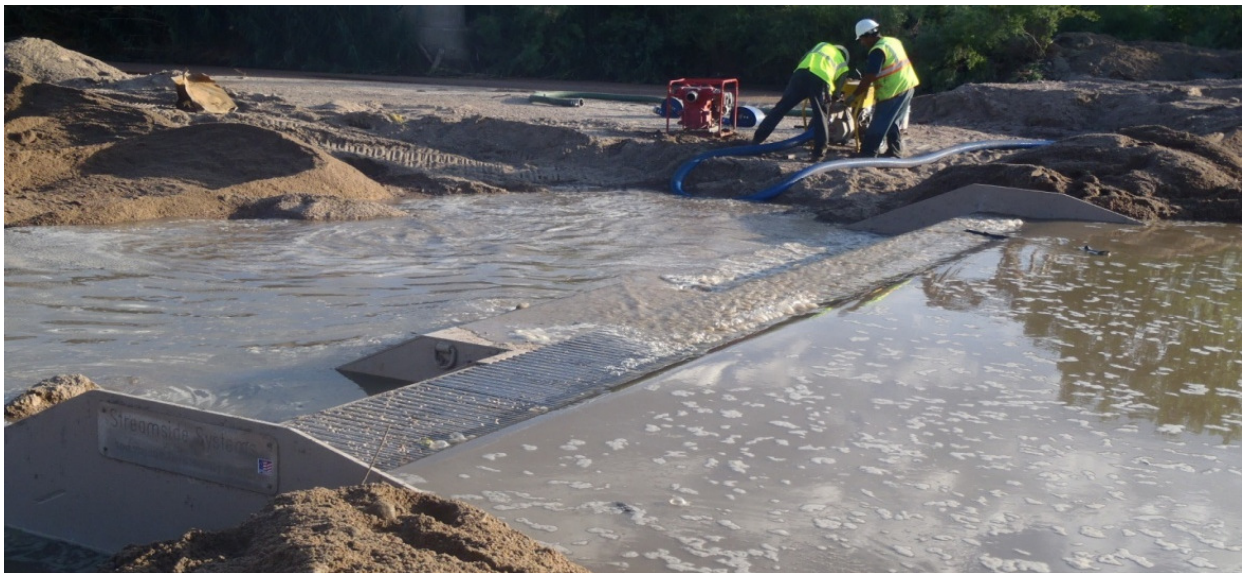
Figure 2 Sediment Collector™ installed in the dry in Fountain Creek.

The primary component of the collector is a steel hopper (Figure 2) placed on the bottom along a sediment transport pathway. A manifold system (see Figure 3) inside the hopper focuses flow across a small region within the hopper, providing high velocities needed to entrain sediment. A dredge pump, housed in the hull with the hopper, pumps water and sediment through the manifold to the placement area. The pump can also be mounted remotely on land, the preferred configuration for maintenance. Booster pumps can be added to increase the pumping distance, as required.