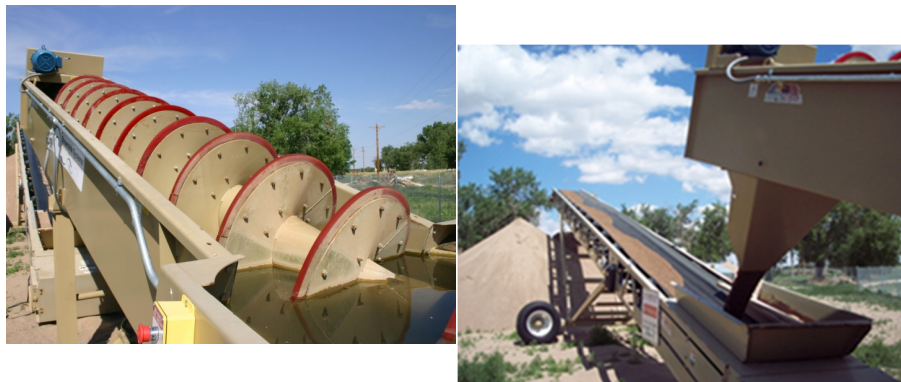
Figure 4 Archimedes screw separator (left) and stacker (right).

The system can either be operated in an open or closed cycle. In the open cycle, water is drawn into the Collector manifold from across the screen, since the area of the screen openings is much greater than the area of the manifold orifices, velocity across the screen is very small ( <1 ft/s), even though velocity at the manifold is large enough to transport sediment. In the closed cycle, the slurry is discharged into a holding tank and separated from the water, and then the water is returned to the collectors opposite side of the suction manifold, so that water is drawn from the holding tank instead of across the screen; advantages of the closed cycle include minimal impingement velocity (reducing potential for clogging) on the hopper screen, reduced risk of entrainment of aquatic organisms, and greatly reduced consumptive water loss. Sediment is discharged into a bin at the base of the screw separator (Figure 4 left), which separates and drops the coarse sediment onto the stacker (Figure 4 right). Sediment is stockpiled at the stacker until it can be trucked away.