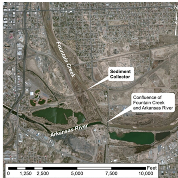
Figure 1 Location of Sediment Collector™.

An innovative sediment management method, a 30-ft wide, high capacity, Sediment Collector™, is currently installed in Fountain Creek, Pueblo, Colorado upstream of the confluence with the Arkansas River (location shown in Figure 1). This installation is intended to demonstrate a new technology available to reduce the need for dredging. This Sediment Collector™ was installed to demonstrate technology needed to alleviate the need for dredging by lowering the downstream grade to reduce flooding and ultimately reduce sediment deposition as far downstream as John Martin Reservoir, a U.S. Army Corps of Engineers (USACE) managed lake. The system operates on the principle that sediment in bedload can be trapped by gravity and removed at the natural rate of transport, instead of episodically. This technical paper describes the technology and installation at Fountain Creek, other possible applications, lists lessons learned, cost, and provides some general guidance for applying collector technology at other sites.