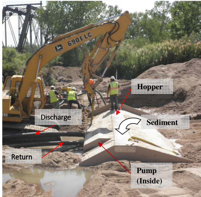
Figure 3 Sediment Collector™ at install.

The system can either be operated in an open or closed cycle. In the open cycle, water is drawn into the Collector manifold from across the screen, since the area of the screen openings is much greater than the area of the manifold orifices, velocity across the screen is very small ( <1 ft/s), even though velocity at the manifold is large enough to transport sediment. In the closed cycle, the slurry is discharged into a holding tank and separated from the water, and then the water is returned to the collectors opposite side of the suction manifold, so that water is drawn from the holding tank instead of across the screen; advantages of the closed cycle include minimal impingement velocity (reducing potential for clogging) on the hopper screen, reduced risk of entrainment of aquatic organisms, and greatly reduced consumptive water loss. Sediment is discharged into a bin at the base of the screw separator (Figure 4 left), which separates and drops the coarse sediment onto the stacker (Figure 4 right). Sediment is stockpiled at the stacker until it can be trucked away.