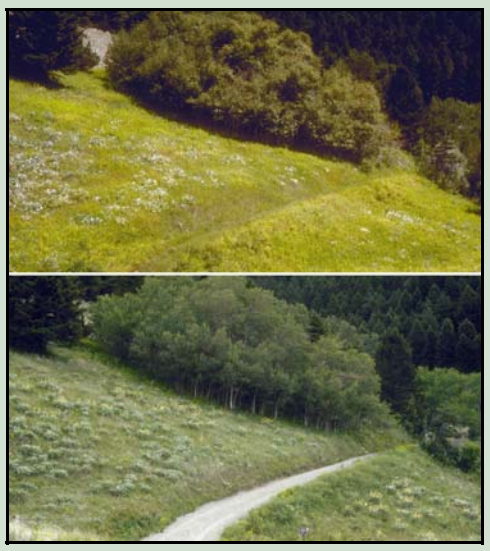
Figure 1—Photo point monitoring of a leafy spurge infestation before (A) and after (B) the introduction of copper leafy spurge flea beetles.