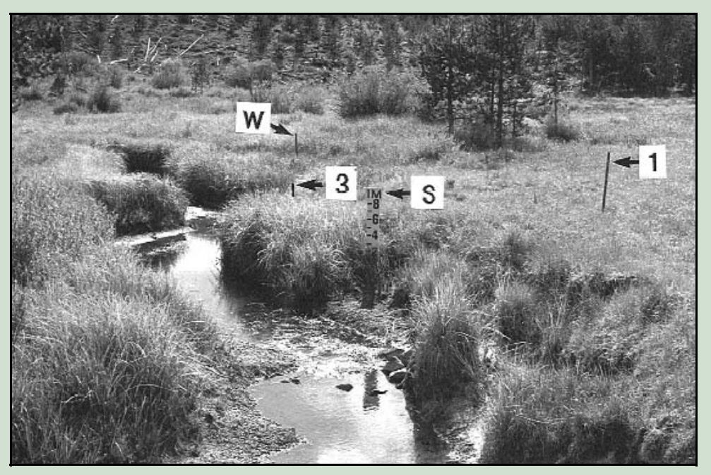
Figure 2—Photo point monitoring site showing photo points (S and W), and camera points (1 and 3), marked by fenceposts. (Adapted from Hall 2002.)