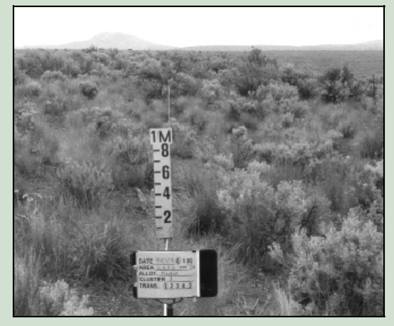
Figure 3—Photo point monitoring site showing a photo identification card and a meter board. (Adapted from Hall 2002.)