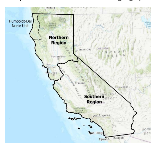
Figure 1 – CAL FIRE study areas.

The CAL FIRE Units are required to report their completed prescribed burn acreages annually. Burn perimeters are documented in a geographic information system geodatabase (2019 FRAP).