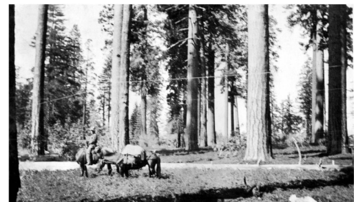
Historic conditions in a ponderosa pine stand circa 1917 (Sierra National Forest Photo HP03137).

We use historical forests (as described by their natural range of variation) as a bench-