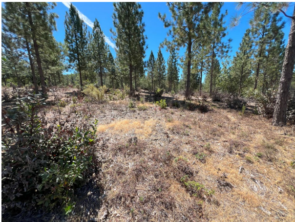
Treatment 30: Vista XRT II 20oz/ac, Accord XRT II 1qt/ac, Rainer EA 0.5% Control: 89% Application: Spot Spray – summer Cost: $84/acre – 3 rd most cost effective