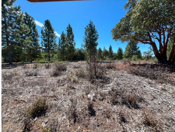
Treatment 26: Garlon 4 Ultra 2%, Imazapyr 4SL 1%, Accord XRT II 3%, MSO 2% Control: 94% Timing: Spot Spray – spring Cost: $152/acre