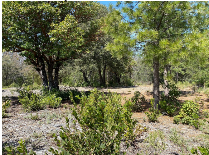
Figure 3. The demonstration site prior to treatment.

elevation. Dominant trees in the area include ponderosa pine, douglas fir, madrone, live oak, and black oak. The brush understory consist of toyon, coyote brush, yerba santa, rabbit brush, poison oak, himalayan black berry, french broom, and mountain misery.