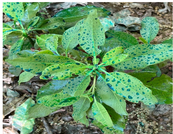
Figure 9. Example of droplet spray pattern from a low volume drizzle application