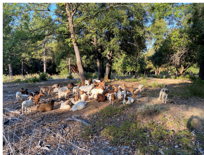
Figure 5. Goats and sheep being utilized to treat brush, tree and weed regrowth.

Grazing: Many animal species, including cattle, goats, and sheep, are used to consume vegetation for prescribed grazing. Property owners may own their own animals, provide pasture to neighbors who own animals, or hire a contract grazer. Goats and sheep exhibit a particularly wide preference for many forb, shrub, and tree species. Locally sourced animals may have a higher appetite for the target plant species and result in better control. For this treatment, a local contract grazer utilized 48 goats, 2 sheep, and 1 livestock guardian dog to graze the area. The animals grazed the area for 14 days at $650 per acre. Grazing was conducted in the fall when woody plants were preparing to store carbohydrates from the above ground portion of the plant to the roots (Figure 5). By intensively grazing at this time, plants may be more susceptible to injury. This treatment provides rapid visual results with nearly all vegetation stripped and small diameter branches consumed. One year after treatment, this method was providing 70% control.