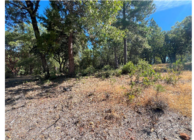
Treatment 3: Flaming Control: 4% Application: spring Cost: $247/acre