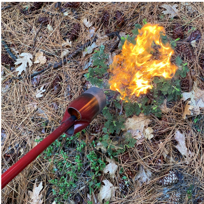
Figure 6. Flaming utilizes a torch and liquid propane to apply high heat to leaf tissue resulting in cell death.

undesired plants without igniting them. The flame is waved over the plant to significantly raise its internal temperature, resulting in cell rupture and subsequent death (Figure 6). Only use this treatment during periods of low wildfire risk, such as immediately after a rain event, early in the growing season when surrounding vegetation is green, and in compliance with local fire restrictions. For this method, treating 1 acre took 11 hours and 14.5 gallons of propane for a total treatment cost of $247 per acre (minimum wage labor rate of $15/hr. used). Despite initial blackening of leaves, treatment only resulted in 4% control 16 months later.