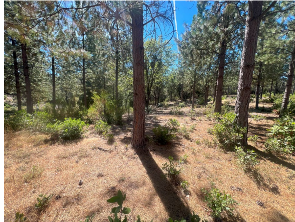
Treatment 34: Acetic acid (organic) 20% undiluted Control: 1% Timing: Spot Spray – summer Cost: $430/acre – Most expensive chemical treatment