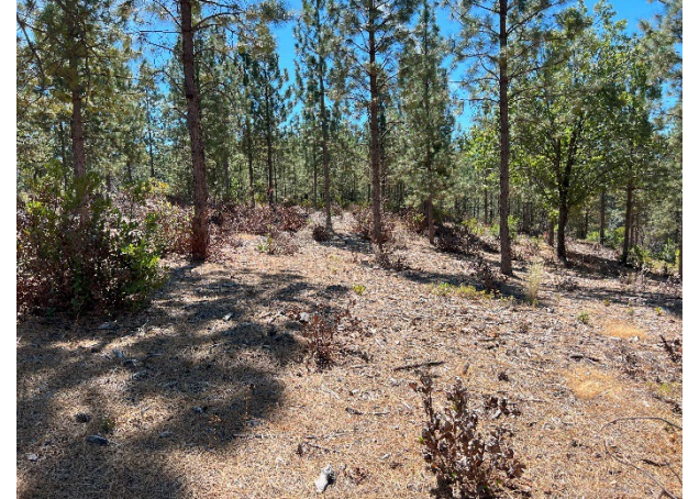
Treatment 31: Oust XP 3 oz/ac, Accord XRT II 6qt/ac, Rainer EA 0.5% Control: 91% Application: Spot Spray – fall Cost: $87/acre – 2 nd most cost effective