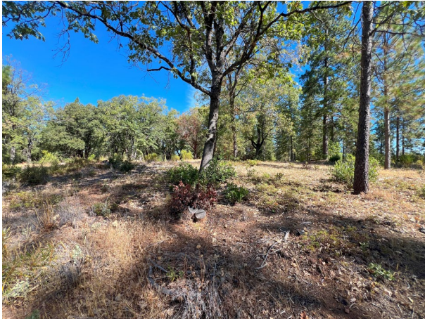
Treatment 1: Untreated Control: 0% Cost: $0/acre