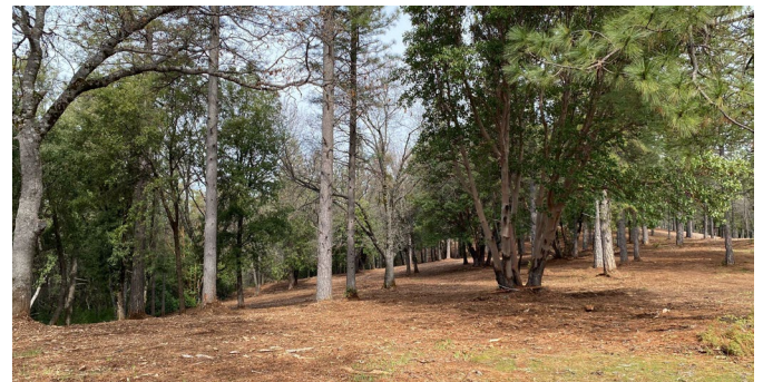
Figure 2. Following mastication, the forest understory has been opened eliminating any fuel laddering and smaller diameter trees removed to allow larger trees to flourish.

Following mastication, a park-like appearance is often the result with well-spaced trees and very little understory (Figure 2). In the years following mastication, brush growth occurs and, if left unchecked, the area will return to a similar condition before mastication occurred.