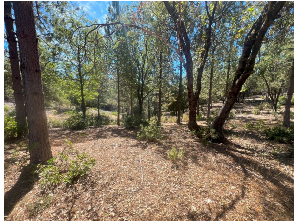
Treatment 33: Axxe (organic) 20%, Natural wet 0.8% Control: 8% Application: Spot Spray – summer Cost: $253/acre - 2nd most expensive herbicide