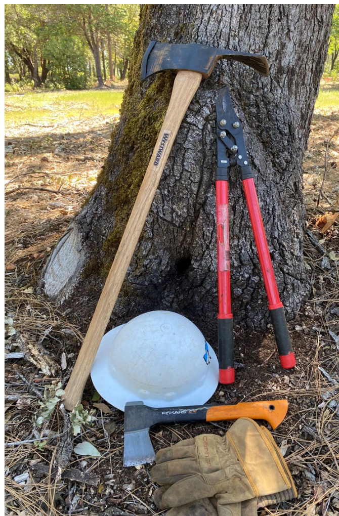
Figure 7. Lopping tools can include loppers, axe, mattock, chainsaw or other forms of equipment.

shrub and tree species may continue to resprout, and repeat treatments may be required for complete control. For this method, the treatment took 13 hours and cost $197/acre at a rate of $15/hr. Cost of equipment was not included. This treatment remained 68% effective 16 months after treatment.