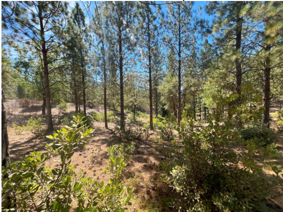
Treatment 32: Homeplate (organic) - 9% v/v, Natural wet 0.8%, Mixwell 0.04% Control: 5% Application: Spot Spray – summer Cost: $181/acre – 3rd most expensive herbicide