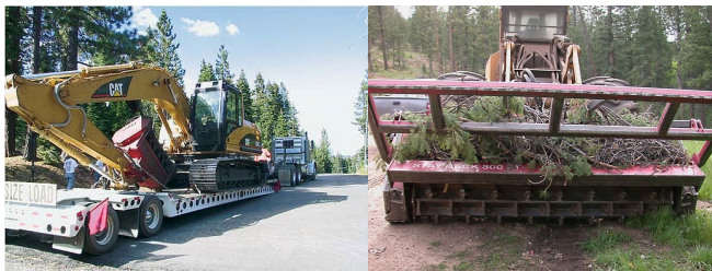
Figure 1. a) Fecon Bull Hog BH 80 masticator head is mounted to the boom of a Caterpillar 235 excavator. b) Mastication, mechanically chewing up brush and branches, can be used to thin brush and trees.

Fuel breaks are strategic projects that are manually implemented to break up large, continuous tracts of dense vegetation. They are often placed along ridge lines, access roads or outside of residential areas along the wildland urban interface (WUI). These footprints on the landscape provide opportunities for fire suppression resources to slow fire spread. To create fuel breaks, dense forests must be thinned and woody biomass either removed or modified to change the fuel structure of the area. One main objective is to remove dense brushy fuels and the continuity of fuels from the ground surface to tree canopies. To achieve this, several different methods can be done including mastication, brush piling and burning, and hand thinning. Mastication, also called forestry mulching, is a vegetation management method generally completed with a skid steer or excavator (Figure 1). A special attachment is able to mulch down smaller trees and brush into finer debris similar to what would come from a chipper. This reduces fuels in overgrown forests and is often the most cost effective treatment for large areas.