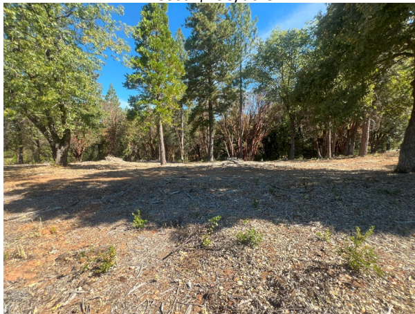
Treatment 5: Lopping plus Herbicide (Accord XRT II 1qt/ac, Vista XRT 20 oz/ac, Garlon 4 Ultra 1 qt/ac, MSO 4pt/ac) Control: 88% Application: spring Cost: $296/acre