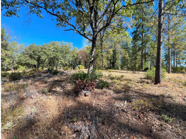
Treatment 1: Untreated Control: 0% Cost: $0/acre