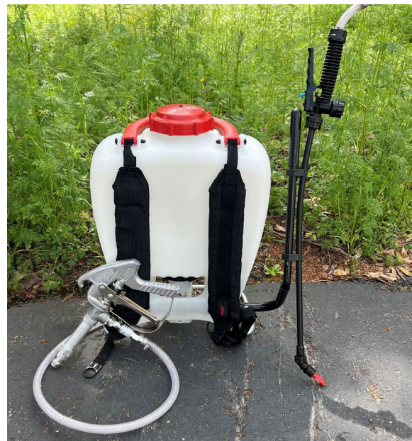
Figure 8. Standard backpack with a wand for spot spray (right) and a low volume gun for drizzle application (left).

the ultra low-volume, a 4-gallon backpack can almost treat an entire acre making this treatment much faster than a spot spray. The amount of herbicide used between a spot spray and drizzle application are similar, with the only difference being the amount of carrier volume (water) used. The drizzle treatment that provided the best control was the Garlon 4 Ultra treatment at 8% v/v with 8% MSO. This treatment was tested both as a spring and fall treatment with the fall treatment providing slightly better control (86% compared to 75%) at a total cost of $65 per acre.