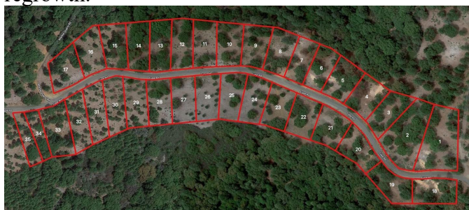
Figure 4. Map of the 33 treatment plots and the 2 untreated control plots. Table 2 describes which treatment method was applied to each plot.

Figure 4 shows a plot map of the demonstration site with the 33 treatments including 2 untreated plots. Most treatments were 0.5 acre in size, with the grazing treatment (plot 2) being an acre and one of the organic treatments (plot 34) being 0.25 acre. Woody regrowth at the site averaged 2-3 feet in height with some trees having as much as 10 feet in regrowth.